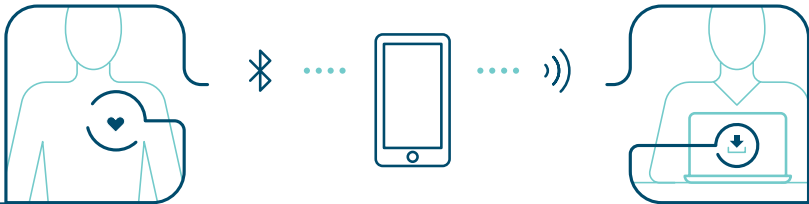
Patient Heart Device

Family members are welcome to listen in on the call. It can be helpful to have someone with you to learn how the app works.