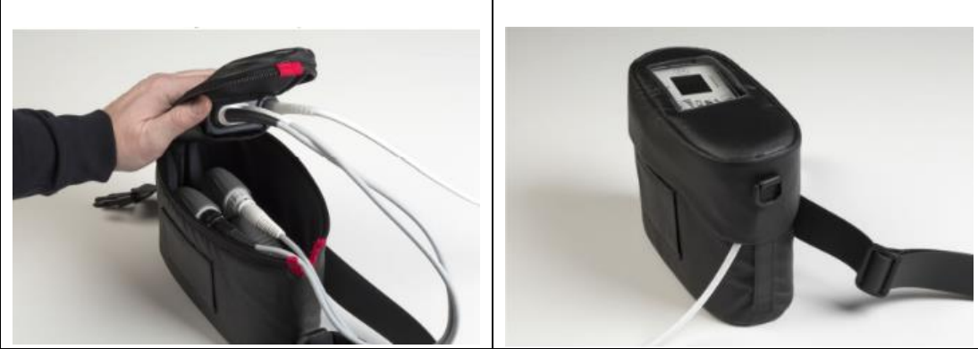
Images of Controller inside Shower Bag

Refer to IFU and PHB pages 152-157 on how to use the Shower Bag and the image below of the Controller stored within the Shower Bag.