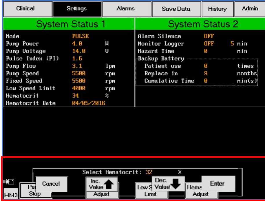
Figure 1 – Example of Atypical Screen Behavior, Overlapping Buttons