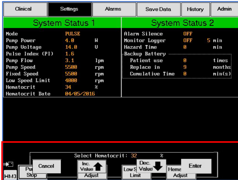
Figure 1 – Example of Atypical Screen Behavior, Overlapping Buttons