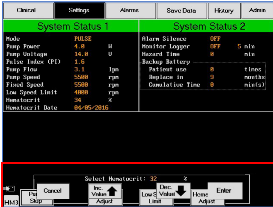
Figure 1 – Example of Atypical Screen Behavior, Overlapping Buttons