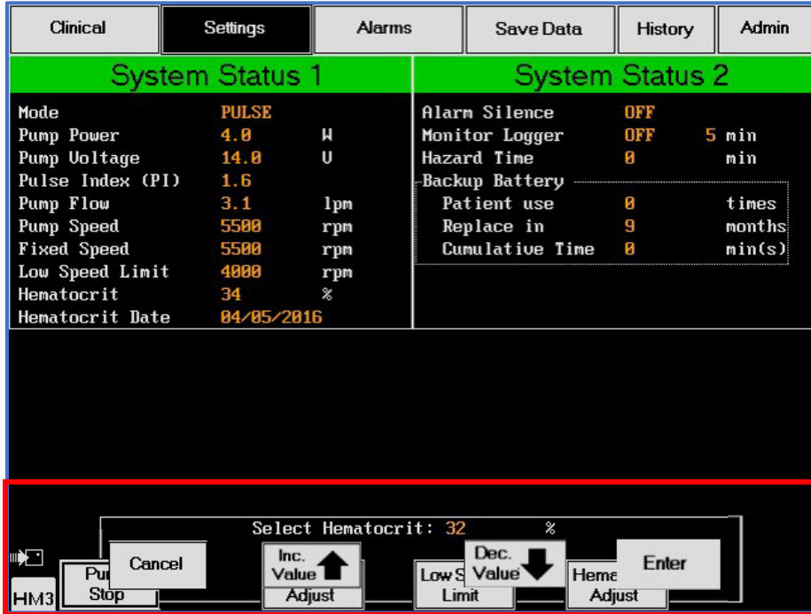
Figure 1 – Example of Atypical Screen Behavior, Overlapping Buttons